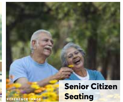
Senior Citizen Seating