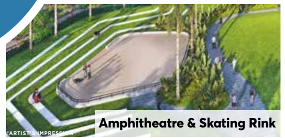
Amphitheatre & Skating Rink