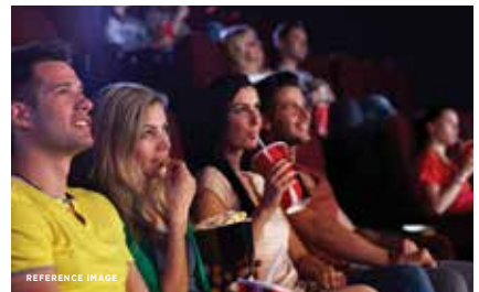
ENTERTAINMENT & MULTIPLEX ZONE